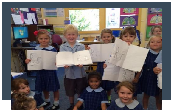
KS learning about the letter "r" and it's sound