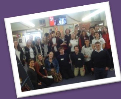
UN Youth Forum, 28 May 2018